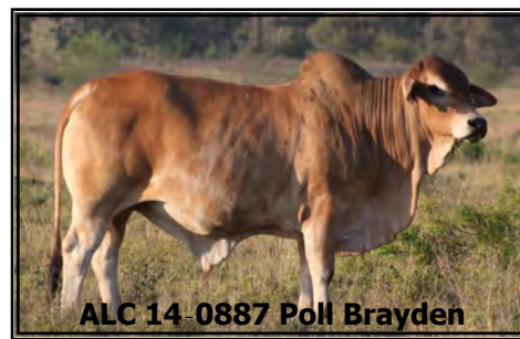
ALC 14-0887 Poll Brayden