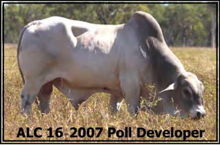
ALC 16-2007 Poll Developer