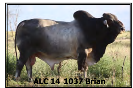
ALC 14-1037 Brian