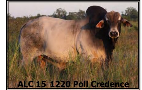
ALC 15-1220 Poll Credence