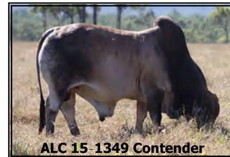
ALC 15-1349 Contender