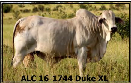
ALC 16-1744 Duke XL