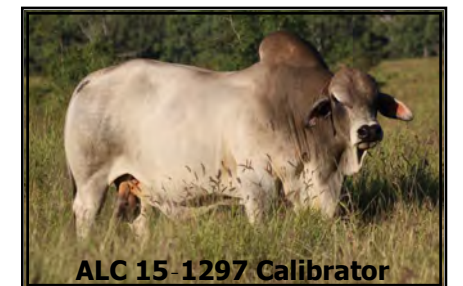
ALC 15-1297 Calibrator