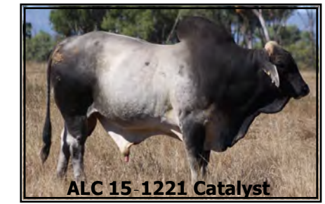
ALC 15-1221 Catalyst