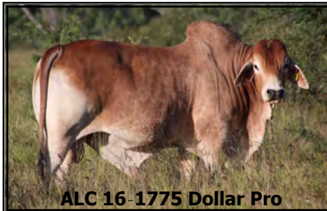
ALC 16-1775 Dollar Pro