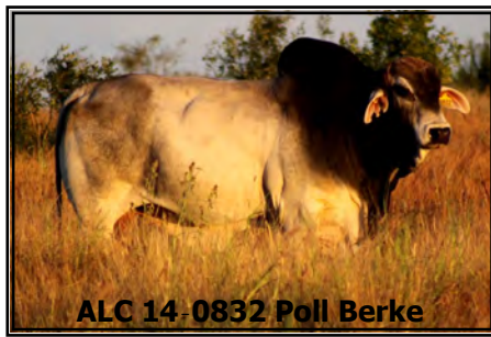
ALC 14-0832 Poll Berke