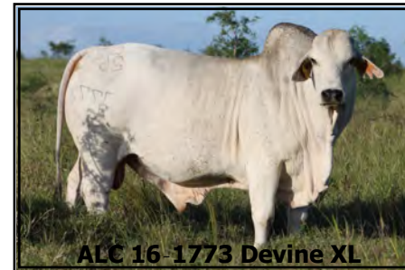
ALC 16-1773 Devine XL