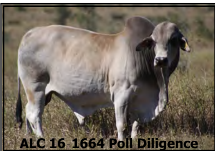
ALC 16-1664 Poll Diligence