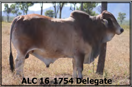
ALC 16-1754 Delegate