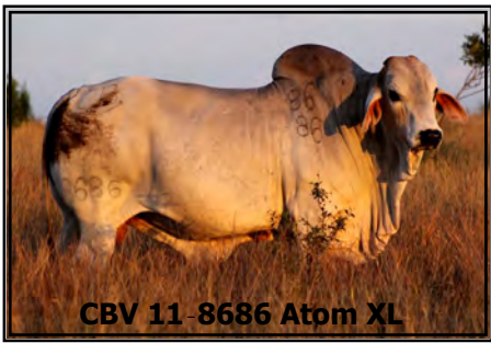
CBV 11-8686 Atom XL