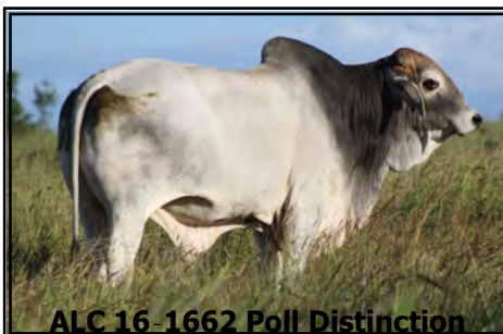
ALC 16-1662 Poll Distinction