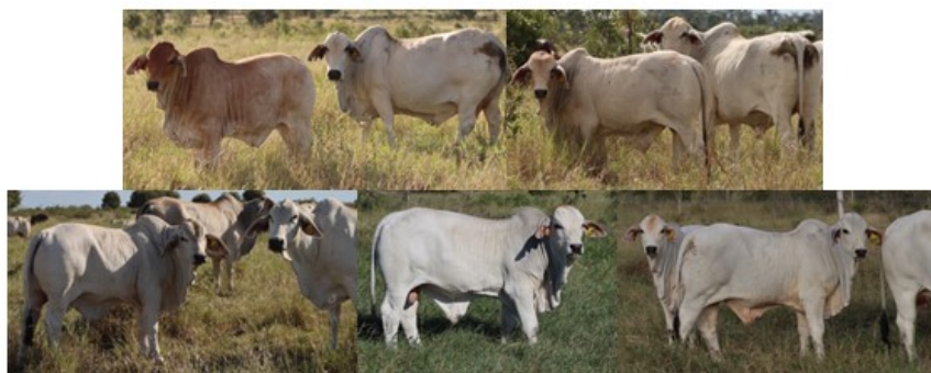
"Gundaroo" calves just before wean 2023

Almost all empty cows are now sold with the remaining few to go before the end of June. Our tight and early calving period allowed us to complete weaning in one round on all properties in the first week of April. After shortening our joining period and culling for pregnancy test over the previous two dry year's, we still had further to go in reducing stock numbers, so we took the opportunity to tidy the herd up through structure, phenotype, temperament, and fly bites etc. The results were evident in the weaner pen this year with a very uniform line. The weaner heifers will be joined this October and we look forward to the results.