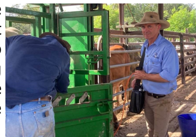
Semen collection of 2023 Sale Bulls

Drafting sale bulls is another enjoyable time for us at ALC. We take the time to use all performance information, along with a phenotype selection, to not only select herd replacements, sale bulls and culls, but analyse our sires to make sure they are delivering the traits we selected in them. We are seeing very pleasing results in our fertility data across multiple generations, increase in two-year-old calving females, early age of puberty and overall, more pleasing phenotype.