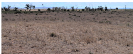
Windmill Paddock at "Gundaroo" in November 2021

For ALC, the season for the last 12 months has been the best I can remember. After thinking we were in for another dry year, the rain started at the end of April last year then came in almost perfect falls. As we had already reduced stocking rate to align with our rainfall to April, the lower stocking rate allowed our country to fully recover in one season. This has allowed us to bring all cattle back from agistment, fully stock our own properties and given us some amazing production results. Our thoughts go out to our clients and friends in the North who are still cleaning up after some extreme weather events this year.